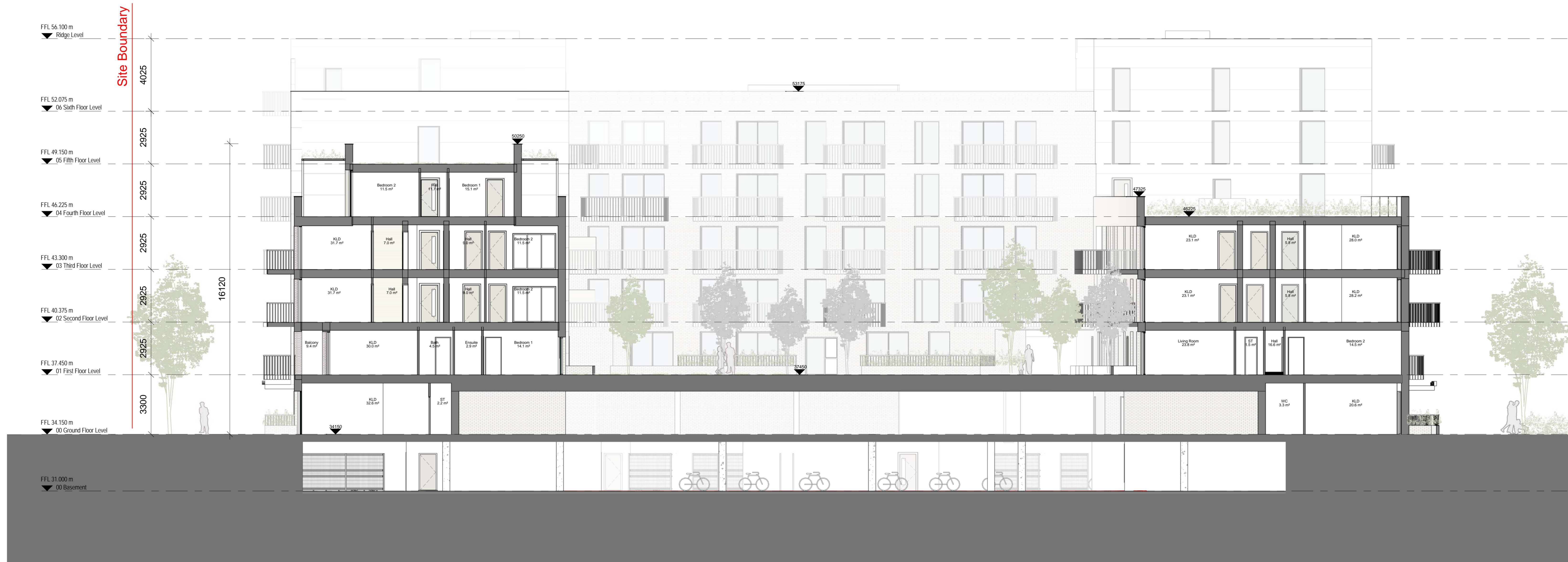
1 Cross Section B 1 : 100